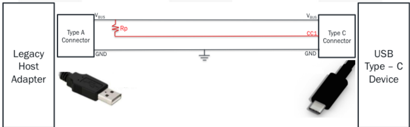
Figure 3. Example of Type A to Type C Cable

The support of existing standard A connectors/host adapters was achieved with a Type A to Type C cable shown in Figure 3. Although, the Type C Specification is public, there are still a lot of bad cables with illegal R_p resistors made and being sold on the market today. Application note AN-6012 explains in detail the bad/illegal cable and how to utilize the Zener diode to protect against it, as well as how to pick the right Zener diode to use.